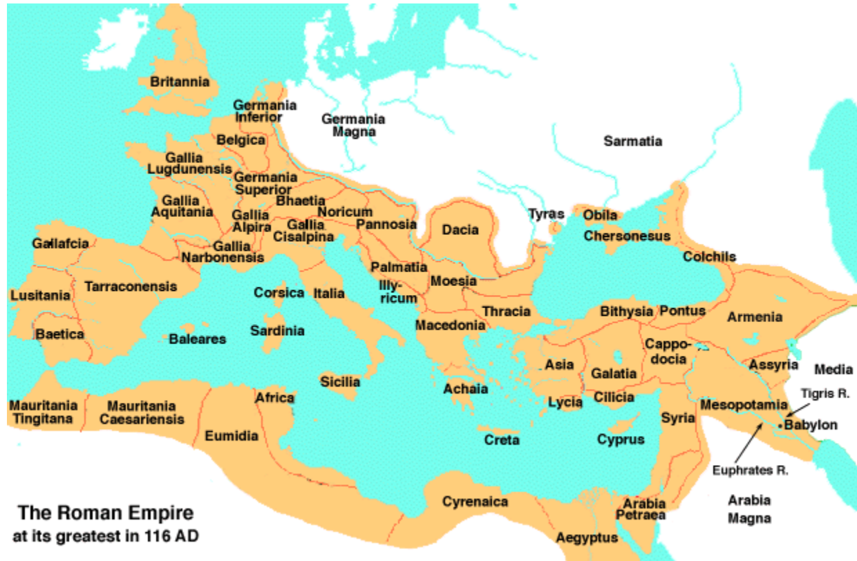
The Roman Empire at its greatest in 116 AD